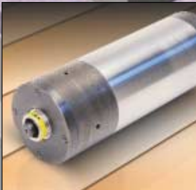
Spindle handles high speeds