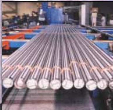
Laser gages bar processing