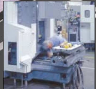
High-tech for the masses